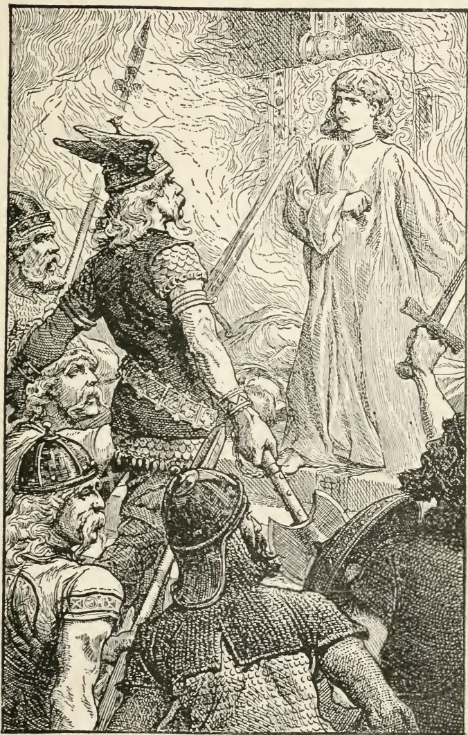
Turgar confronting the Danes in Croyland church.—Page 39.